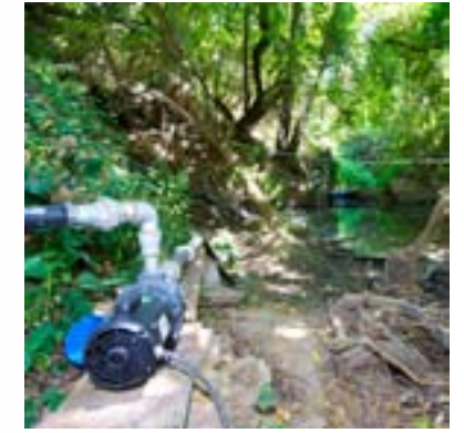
Irrigation provided by new, 2-hp pump and year-round creek.

What an incredible opportunity to own one of the premier properties in Palomares Canyon! Just a short, 1.5 mile drive north to the freeway creates a serene, country lifestyle while maintaining easy access to places important to you. This 5.51 (+/-) acre property has gated access and the surrounding fences were designed to keep hungry deer from your flowers and yards. Drive down the gravel driveway past the orchard to an expansive home with four bedrooms, two baths, and 2670 square feet. The 960 square foot garage and workshop is furnished with 220v power and rolling doors for easy access. Expansive redwood decking across the rear of the home provides a fun, outdoor atmosphere for entertaining family and friends with custom benches and a shady arbor. From the deck, overlook the expansive rear lawn area and listen to the frogs in the creek while the sun goes down. Through the gate and across the year-round creek, another orchard features trees of many varieties that will keep you eating healthy and organically for years to come. This is an ideal property for getting the kids outside, away from the video games, and engaged in active play. Palomares Canyon is a rural lifestyle that's been handed down through generations, where neighbors know and look out for each other, and where you are sure to feel right at home.