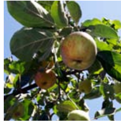
Eat organically for free with over 60 fruit trees in two orchards.