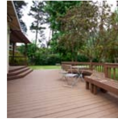
Outdoor living at its finest with expansive yards and redwood deck.