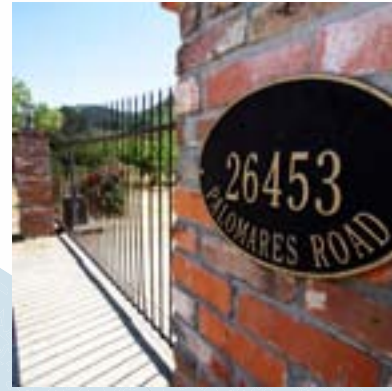
Lighted, brick pillars and wrought-iron, electric gate welcome you home.

Go to www.dublinranchlifestyle.com/26453-palomares-road